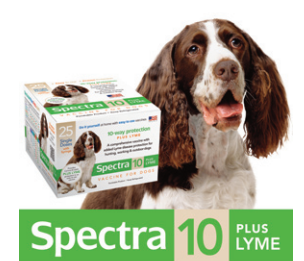
PLUS LYME for outdoor dogs