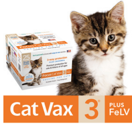
PLUS LUEKEMIA for all ages

Visit us at VaccinateYourPets.com for more information and helpful how-to videos