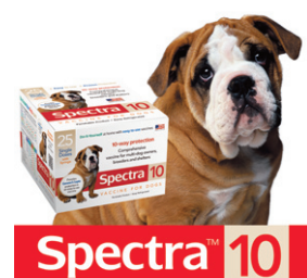
For breeders & multi-dog owners