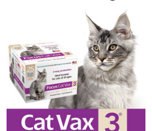
Ideal booster for cats & kittens