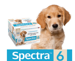
An ideal first shot for your puppy